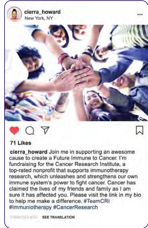
Sample Instagram Post