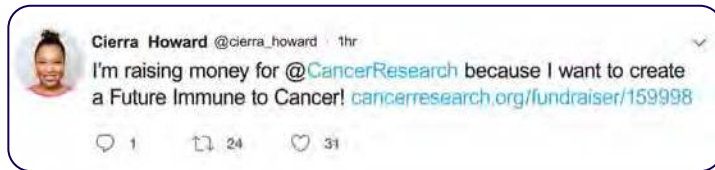
Sample Twitter Post