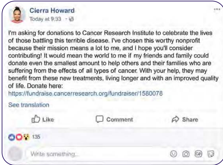
Sample Facebook Post

Finding the right words to use can be hard. Take a look at some of our sample messages for inspiration!