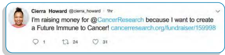
Sample Twitter Post