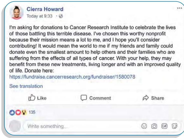
Sample Facebook Post

Finding the right words to use can be hard. Take a look at some of our sample messages for inspiration!