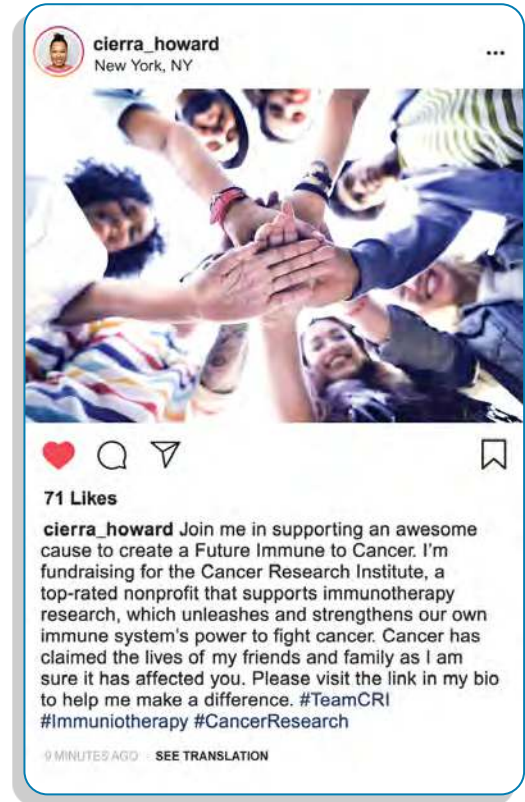
Sample Instagram Post