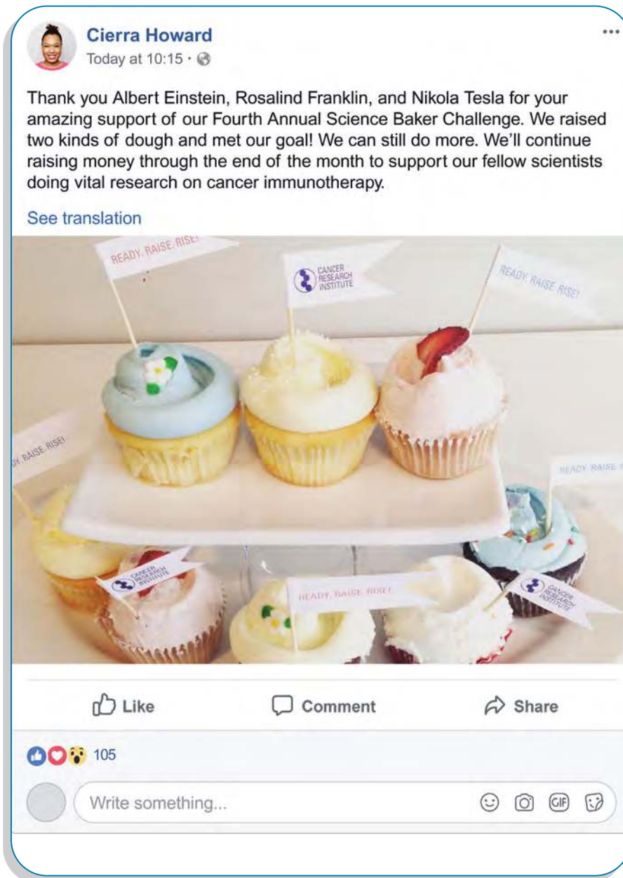
Sample Facebook Post

Don't just thank your donors. Show them the impact of their donations. Follow up with them in 3 or 6 months, sharing news from the Cancer Research Institute about how their donations are making lifesaving cancer research possible. Remind them of their support and you'll make it even more likely that they'll support you again for your next fundraiser.