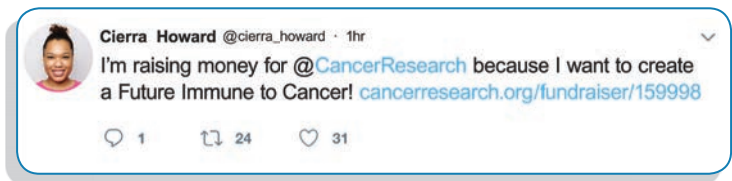
Sample Twitter Post