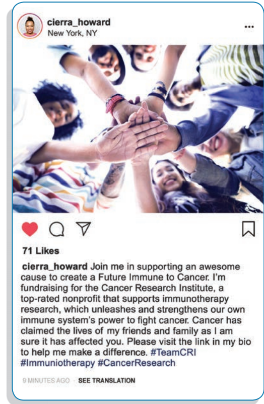
Sample Instagram Post