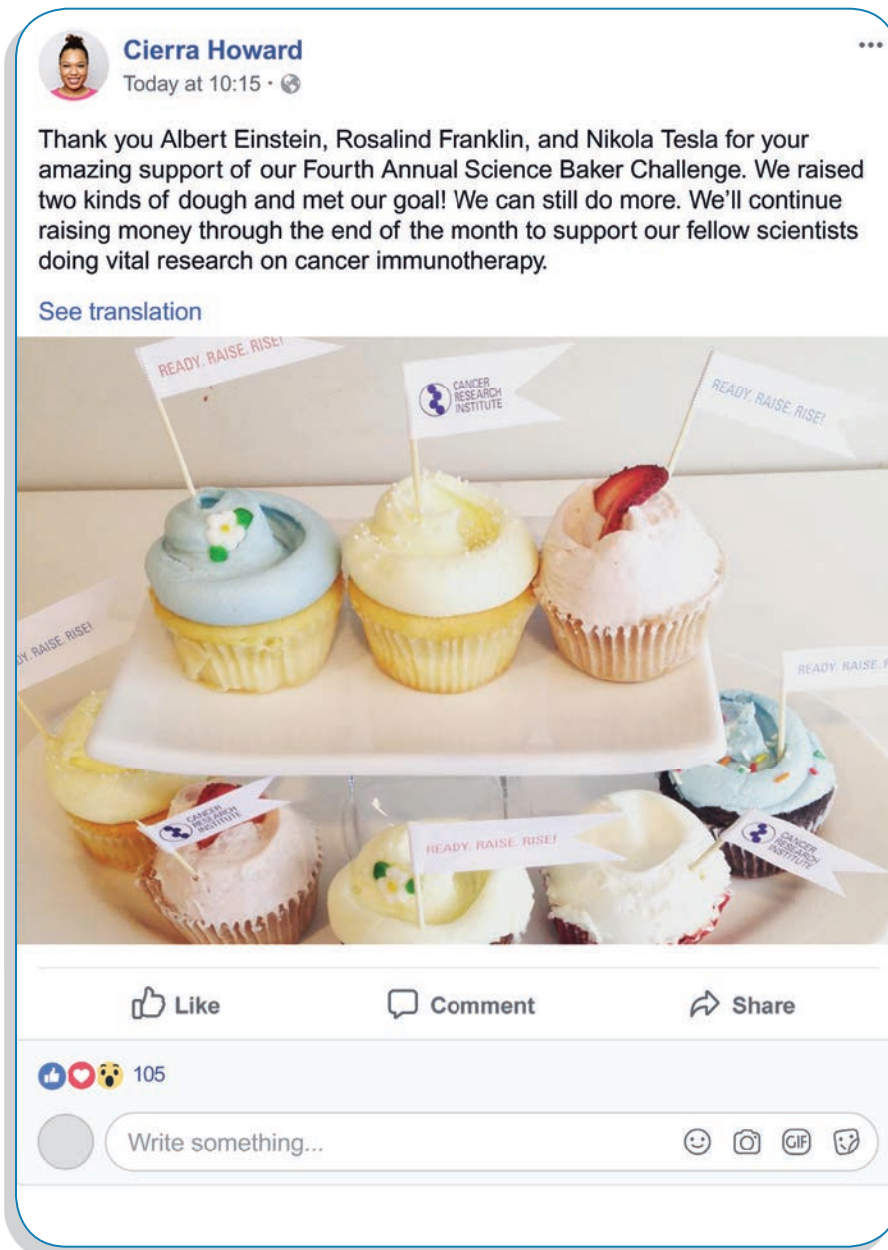
Sample Facebook Post

Don't just thank your donors. Show them the impact of their donations. Follow up with them in 3 or 6 months, sharing news from the Cancer Research Institute about how their donations are making lifesaving cancer research possible. Remind them of their support and you'll make it even more likely that they'll support you again for your next fundraiser.