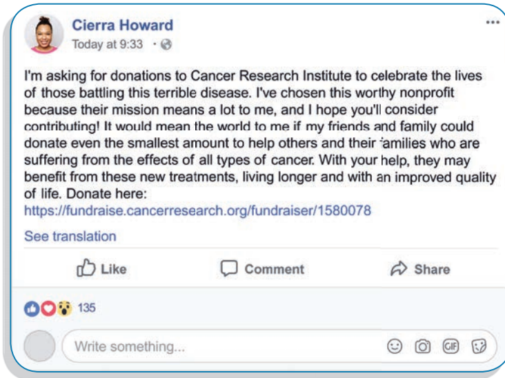
Sample Facebook Post

Finding the right words to use can be hard. Take a look at some of our sample messages for inspiration!